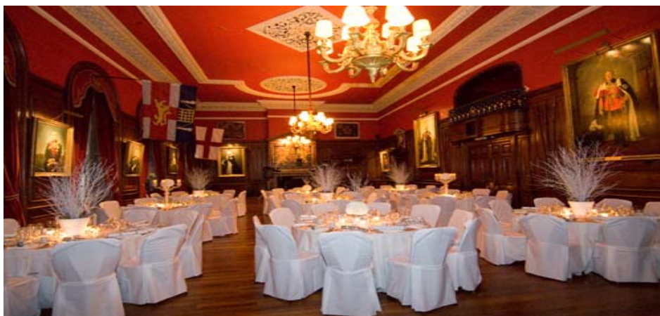
The Long Room at Armoury House

The price for the dinner, including drinks at the reception beforehand and a three course meal with wine and port is £75: after dinner drinks will be available from a cash bar. Early booking is recommended.